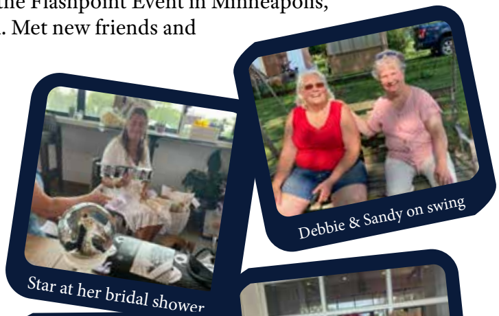
Star at her bridal shower