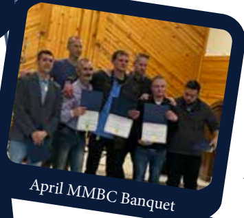
April MMBC Banquet