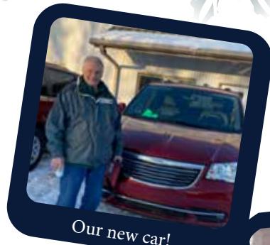
Our new car!

Let it snow, let it snow, let it snow! Depending on where you live, you can see signs of wonder through the snow. Snowcapped mountains, hills, and valleys. Some of us might be shoveling today. Others who live in more tropical climates may just see LIGHTS! My favorite time of the year is when ALL the lights are out. Reminding us of the glory that shined on the Birth of our Savior.