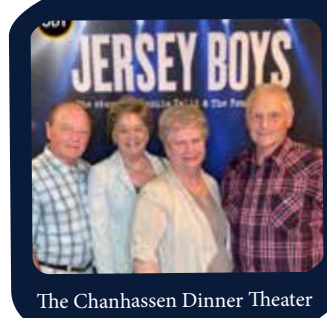
The Chanhassen Dinner Theater